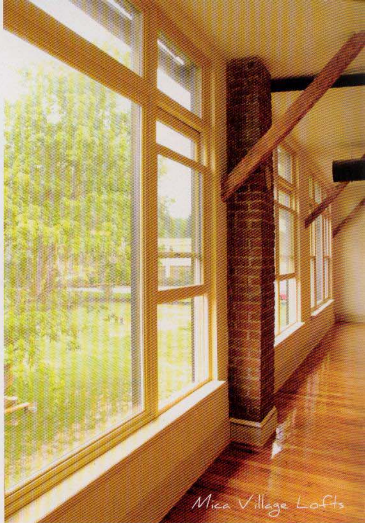
Mica Village Lofts

In Asheville's River Arts district, a downtown neighborhood overflowing with galleries and working art studios, urban industrial living has gone green. The Mica Village Lofts are the restoration and conversion of the Schoonmaker Mica Company building, constructed in 1899, into 10 residential loft spaces. More than 60 percent of the materials used to construct the building were salvaged or recycled from the original plant. The glass used in the lobby's terrazzo floor and in the lofts' countertops came from broken windows; the metal used to support the kitchen bar countertops are from the factory's plumbing pipes. Residences feature exposed brick walls, original hemlock beams, exposed pipes and ducts, and restored original wood flooring. One-bedrooms begin at 830 square feet; prices start at $226,000.