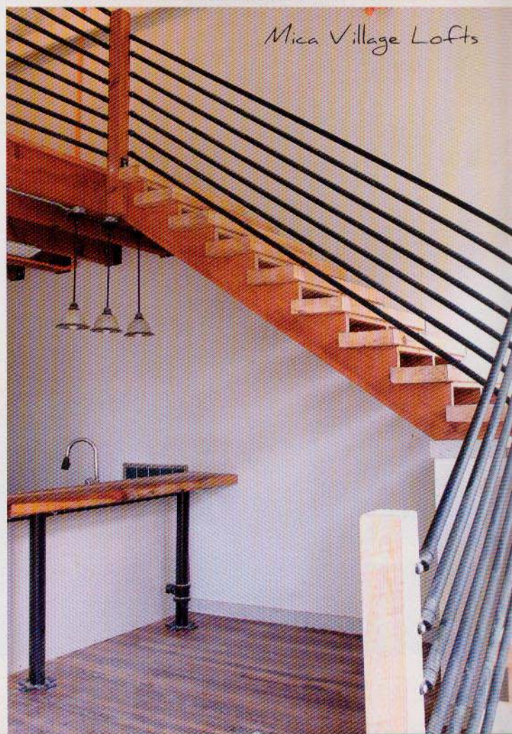
Mica Village Lofts